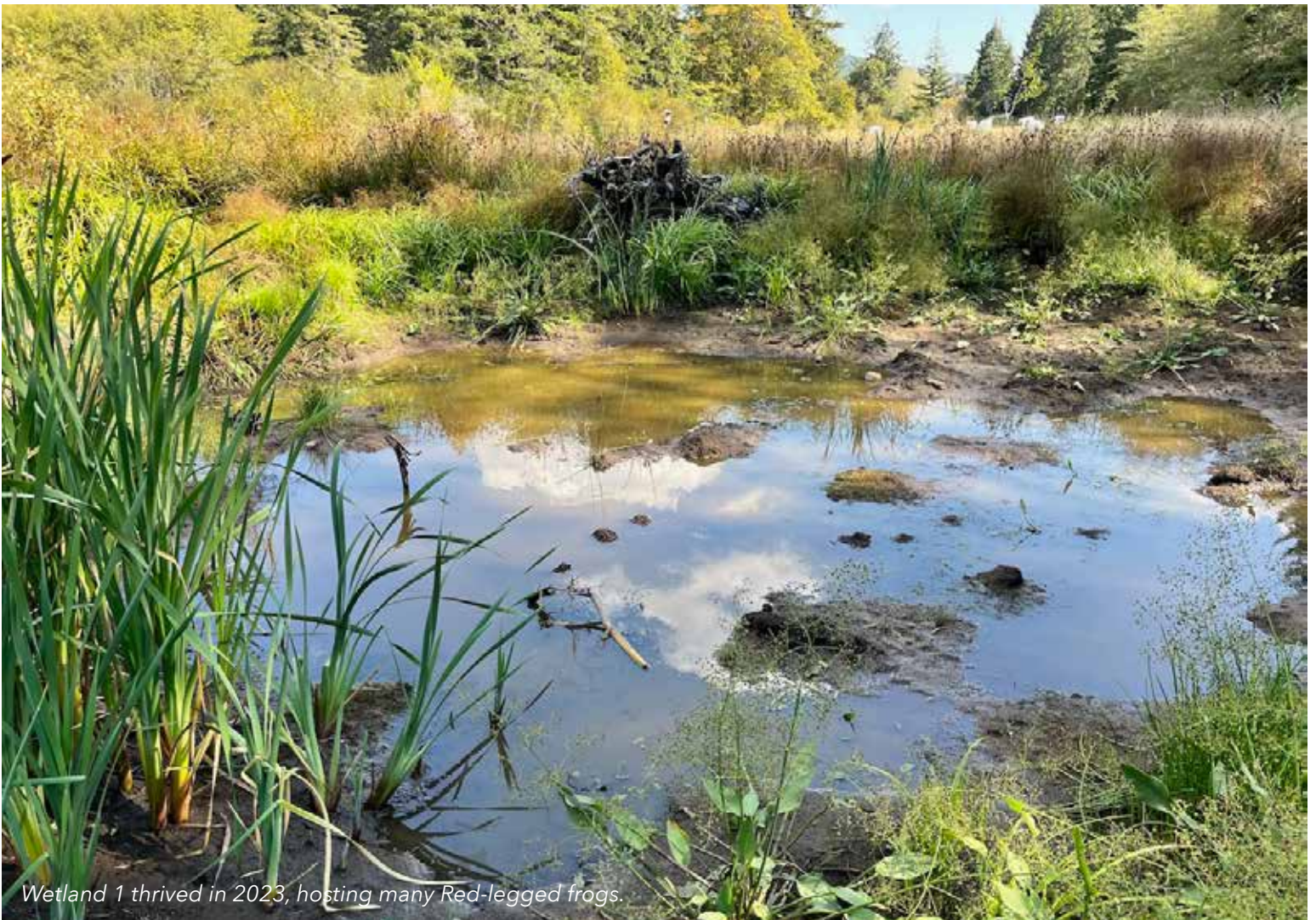
Wetland 1 thrived in 2023, hosting many Red-legged frogs.