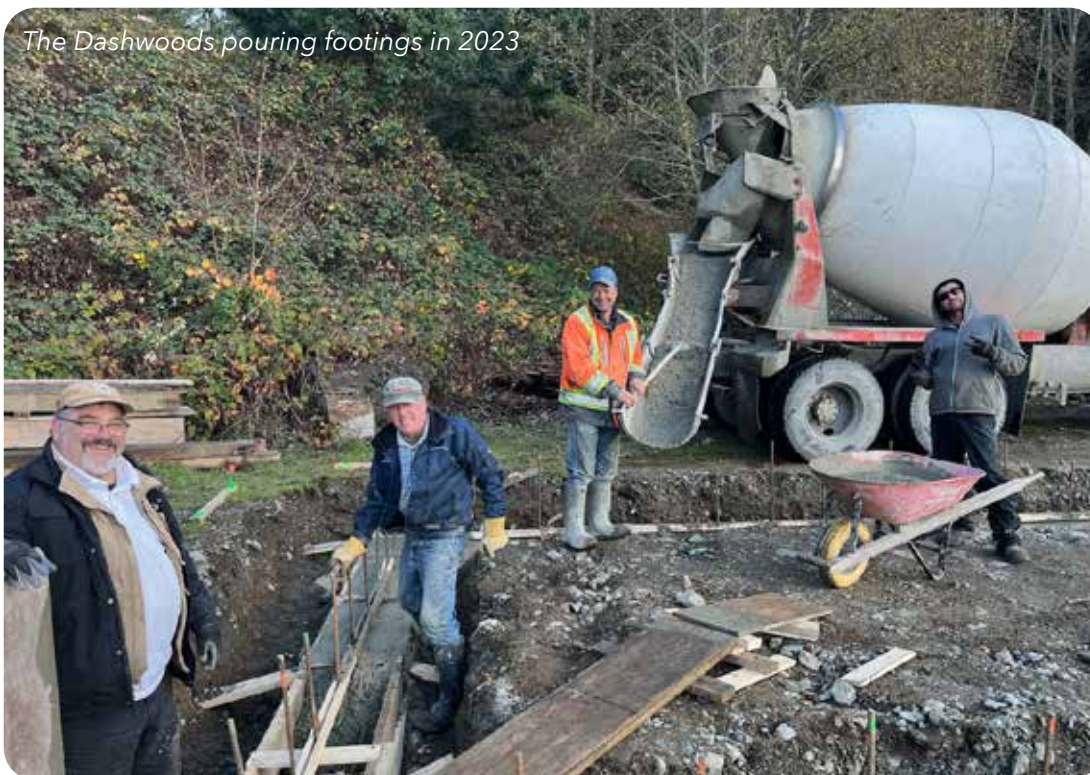
The Dashwoods pouring footings in 2023