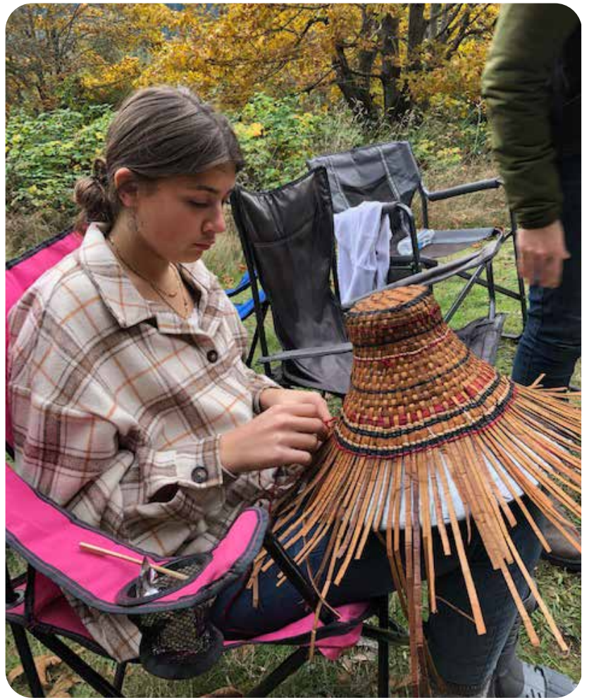
Youth on the Land brings Indigenous youth and Elders together on the land at Xwaaq'wum.

Exciting news: It is with the deepest gratitude to our dear friends at School District 64, for their generous donation of the funds to build Our Outdoor Learning Center. We are pleased to announce it is nearing completion and will soon be fully operational to host our youth.