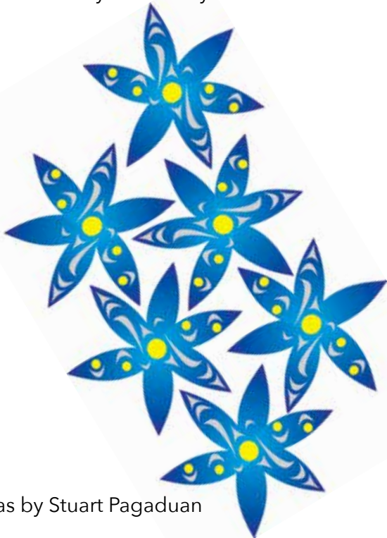
Camas by Stuart Pagaduan

This project aims to recreate conditions for historical camas meadow cultivation. Traditional burning and intensive cultivation of the meadows were done by our ancestors to keep the valuable food plants healthy. The banning of cultural burning, removal of our people and extreme deer browsing has led to the removal of most of the flowering plants in Xwaaqw'um, and threatens the success of any food harvesting here. The fenced restoration project has excluded deer from this sensitive ecosystem, to allow time for flowers to return. This in turn supports over 100 Species at Risk that are endemic to Garry Oak Ecosystems.